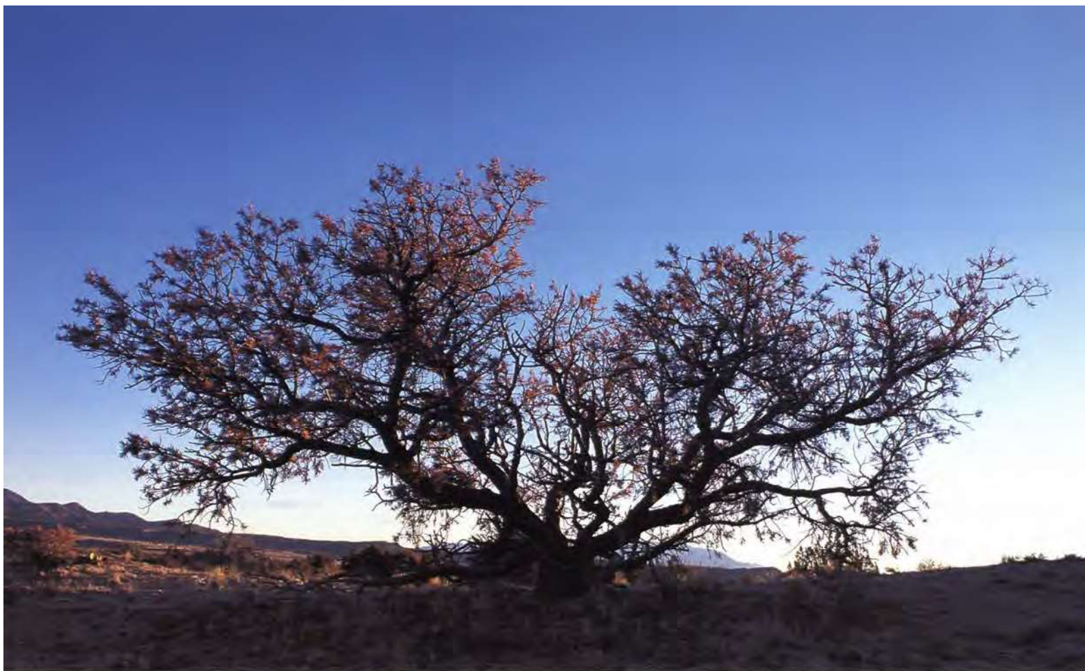
What some see as the first great drought of the 21st century doesn't compare to those of the past, no matter how many thirsty, weakened piñon are sadly lost to the bark beetle.

Despite the individual weaknesses, by putting all of this information together we can build a picture of both short term and long term climatic variability that is both detailed and robust. The temporal variation is coupled with high geographic variation, such that no single reconstruction is accurate for all the Southwest. Droughts have been common but were usually of short duration. At times, periods of persistently dryer and warmer climate occurred that were followed by centuries of relatively wetter climate with reliable monsoon seasonal patterns. A few long droughts are documented in tree-ring records, and archaeologists believe that they can detect human responses to some but not to others. Geographic contrasts are also evident during the few truly dramatic periods of climate change, in which some areas suffered drought while others benefited from increased rainfall, making the picture more complicated.